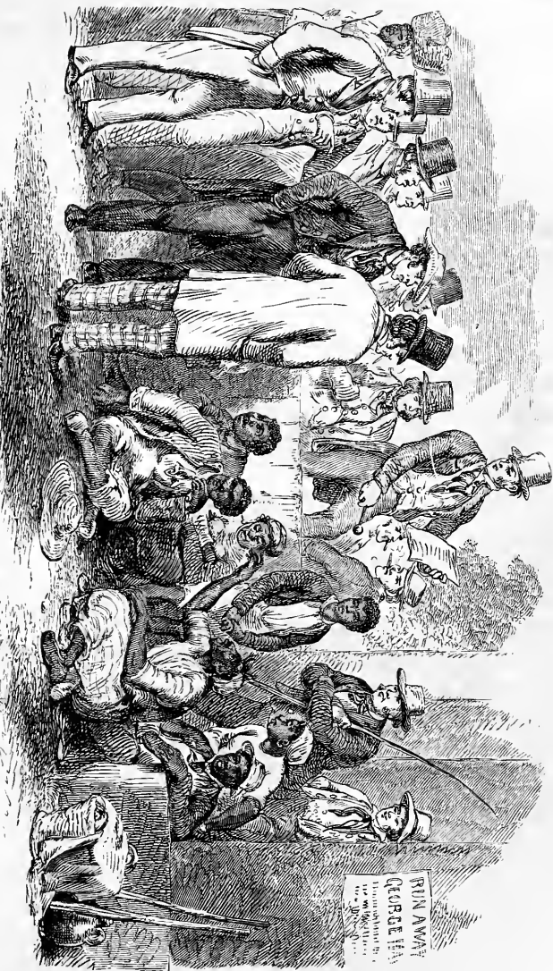
THE AUCTION SALE. Page 171.